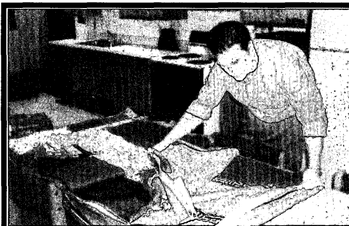
Identifying each flag by country