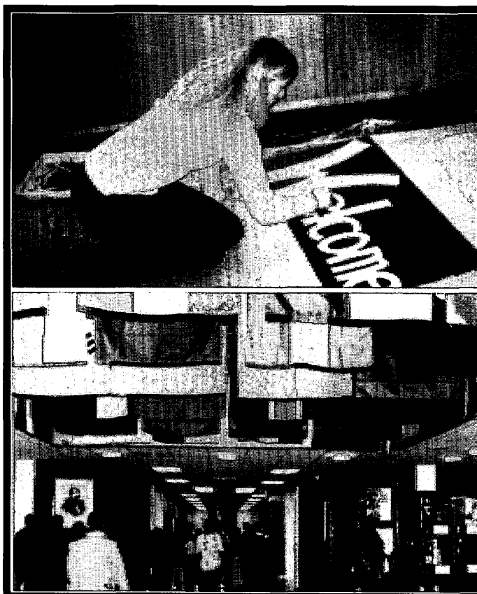
The Welcome Project

With the assistance of several university faculty, I translated four forms (home language, truancy, welcome, computer usage) into Spanish, French, and Russian. The response to the project was incredible. Several other schools in the district now use our translated forms and have asked that we translate more. More parents whose first language