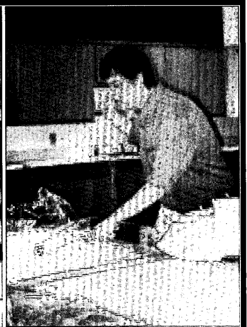
Don't worry, I'm on it

and hands-on experience of this project allowed me to apply my content and foundations knowledge in a real life setting. Lectures, discussions and readings built the theoretical foundation. However, application in the school environment brought relevance and meaning for me. I have learned two crucial points that I will carry into my teaching career: no matter how commendable a project, without collaboration and support from others it is probably doomed to failure and I must be aware of the politics, political agendas and hierarchy of the schools where I will teach. As a teacher I will continually strive to: (1) provide my students with a sense of belonging, (2) develop mechanisms that foster cross-cultural student / student interaction and (3) strive to include all students in the learning process.