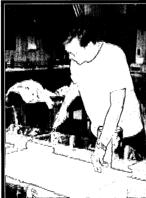
There is more to making signs than meets the eye