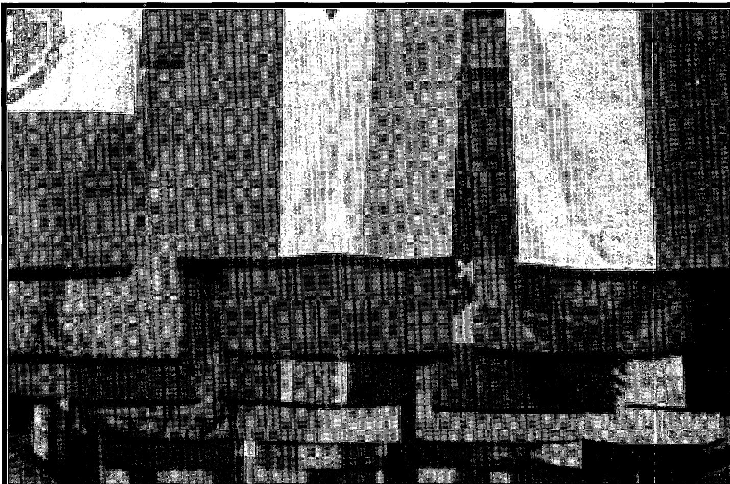
All forty flags on display