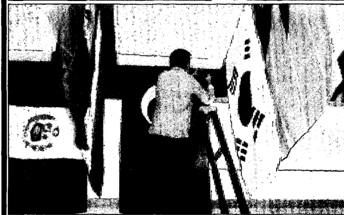
Rehanging the flag project